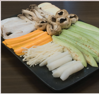
Vegetable BBQ 야채 야외 파티 (Seasonal Mix)