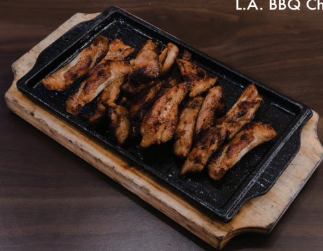
L.A. BBQ Chicken

Try our signature L.A. Korean BBQ barbecue chicken marinated with traditional Korean maranade sauce.