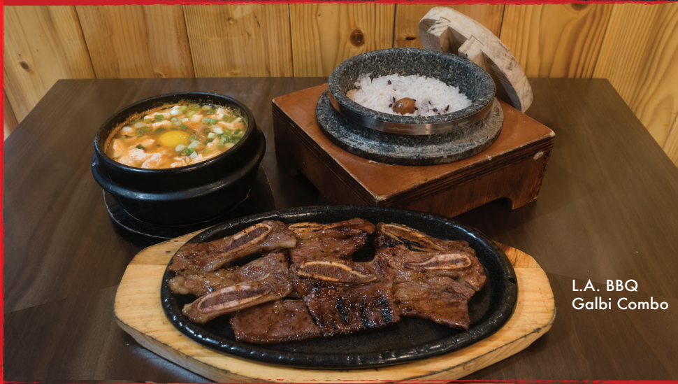
L.A. BBQ Galbi Combo

All signature dishes combos come with our L.A. Hot Stone Pot Rice. Make it KETO ask your server about our lettuce wrap upgrade for only $2.00!