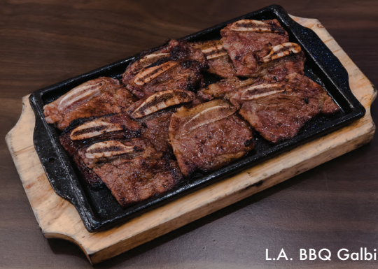
L.A. BBQ Galbi

All signature dishes come with our L.A. Hot Stone Pot Rice. Make it KETO ask your server about our lettuce wrap upgrade for only $2.00!