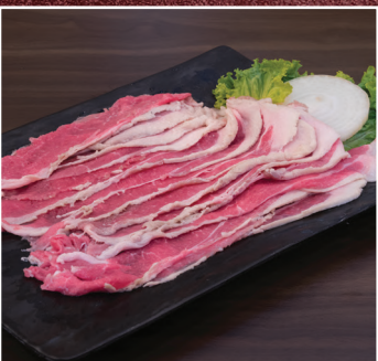
Beef Brisket 차돌박이 (Cow Beef)