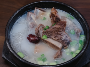
L.A. Galbi Tang

Please ask your server about vegan & vegetarian options.