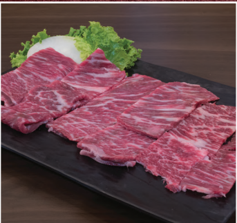
Beef Sirloin 꽃등심 (Cow Beef)