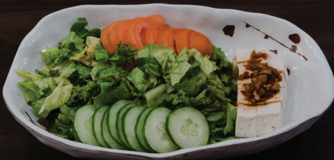
L.A. Tofu Salad

Please ask your server about vegan & vegetarian options.