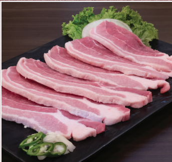
Pork Belly 돼지삼겹살 (Black Pork)