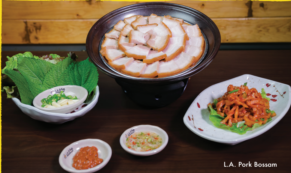
L.A. Pork Bossam

All signature dishes come with our L.A. Hot Stone Pot Rice.