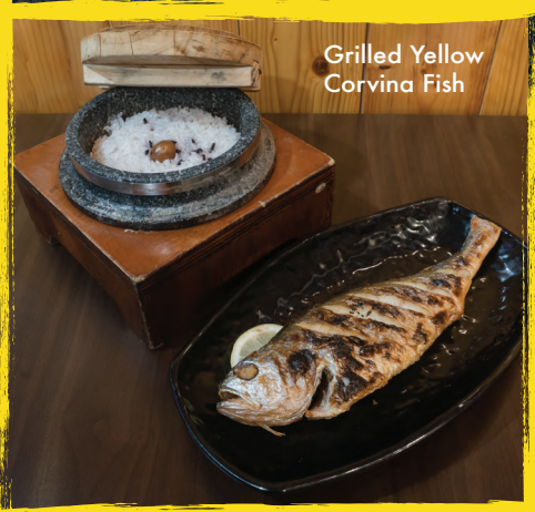
Grilled Yellow Corvina Fish